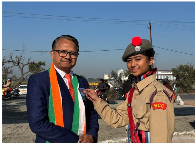
76 th Happy Republic Day