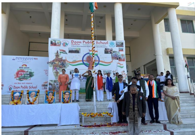
76 th Happy Republic Day