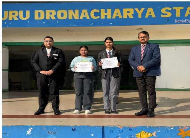
Lavi & Khushi Noida's Top 100 CBSE Aryabhata Ganit Challenge