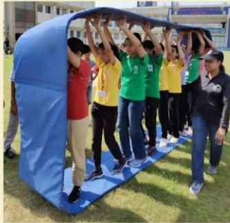
Adventure Camp (24-25)