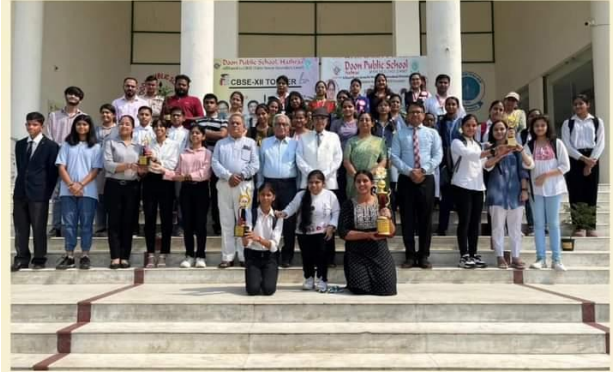
Inter-School Debate Competition