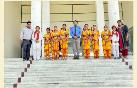
1st position at District Level Singing Competition