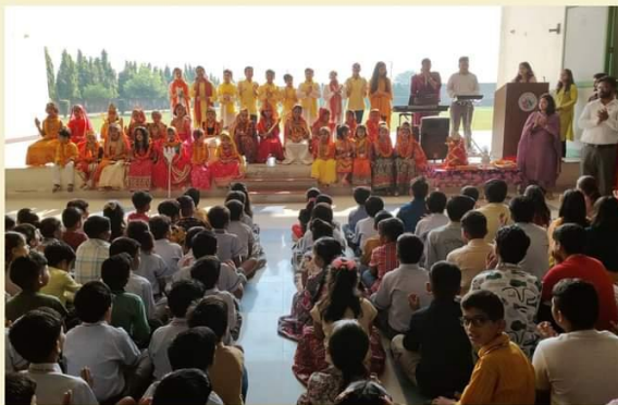
Navdurga and Dussehra Celebration