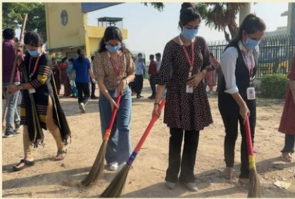
Swachh Bharat Abhiyan